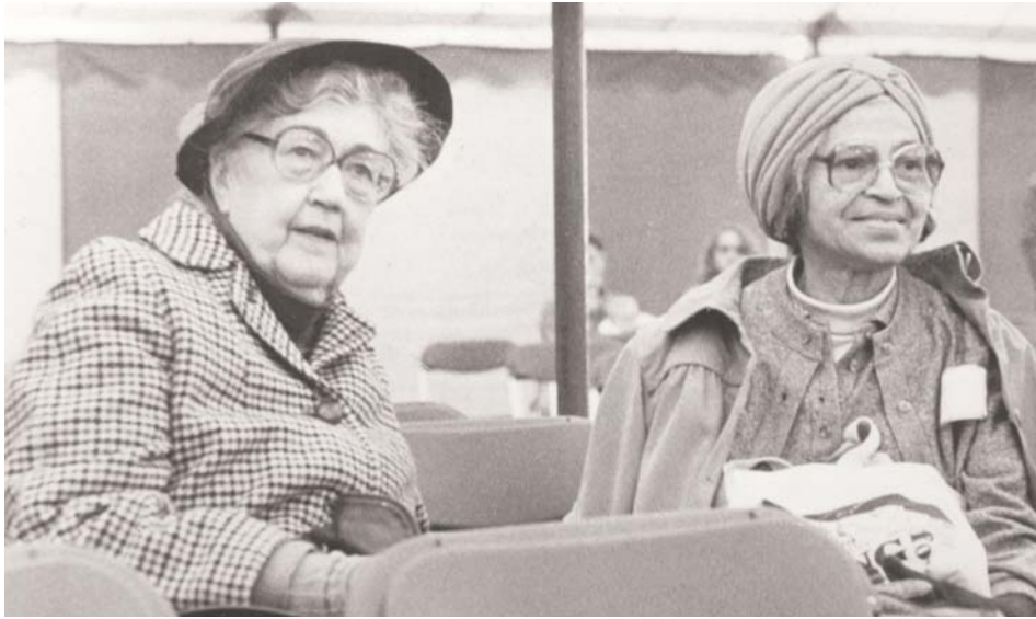
Virginia Durr, left, sits with friend Rosa Parks. Durr is remembered by many as the woman who bailed out Parks when she was arrested just before the Montgomery Bus Boycott.