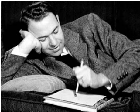
“When I lost my possessions, I found my creativity. I felt I was being born for the first time,” said E. Y. “Yip” Harburg.