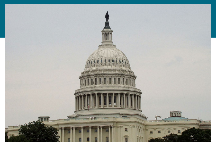
NCMA Huntsville April 18, 2019