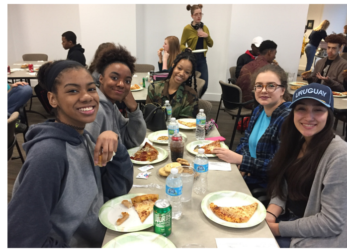
Students from the Dekalb County School for the Arts

On February 7, Baker Donelson's Birmingham office hosted lunch for 103 students, teachers and chaperones from the Dekalb County School for the Arts from Atlanta. The students were on a field trip to the Civil Rights Museum and 16th Street Baptist Church, and treated Baker Donelson attorneys and staffers to a beautiful acapella rendition of "America the Beautiful."